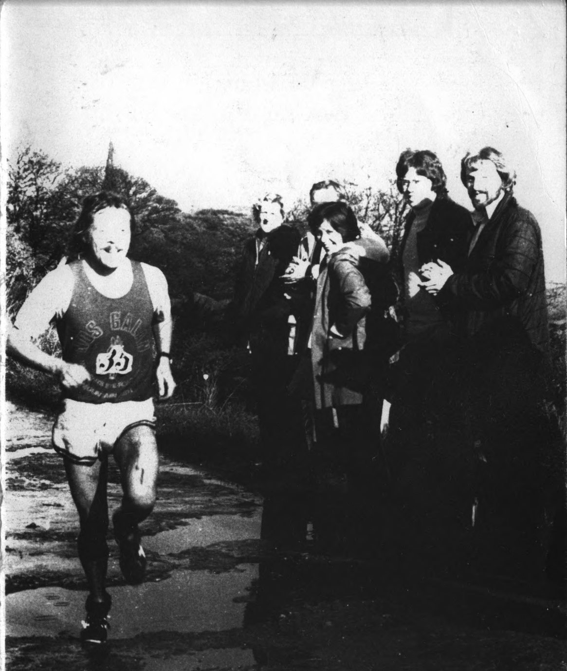
THE FELL RUNNER 1974